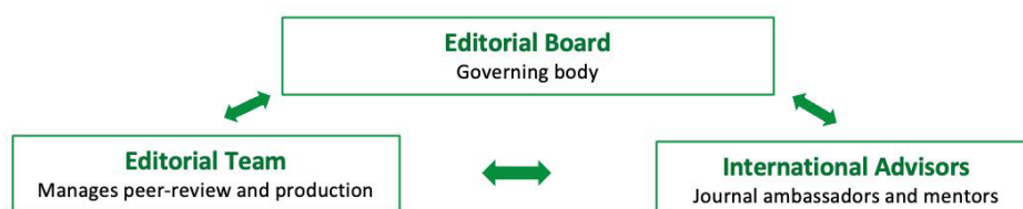
Figure 1. Organisation of SHAJ

SHAJ's governance bodies include the Editorial Board, comprised of representatives from participating Somali academic institutions, responsible for policy decisions, and leveraging professional influence to elevate the journal's profile. There is also a panel of International Advisors acting as ambassadors and mentors. The Editorial Team manages daily operations, led by a chief editor, a managing editor, responsible editors, and a layout editor (Figure 1).