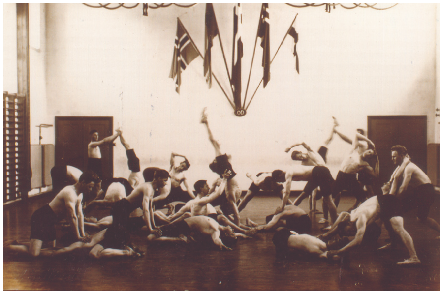
Figure 2. Niels Bukh's so-called primitive gymnastics with close body contact between the half nude young gymnasts in black boxer shorts.

to the different audiences, which was an entirely new feature among adult men. The displays of sports gymnastics had the gymnasts dressed in white one-piece suits that were taken from Lingian gymnastics but made so tightly fitting that nothing regarding the genitals of the performers was left to the imagination, neither for Bukh nor for the spectators.