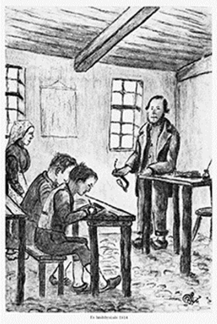
Figure 1. The drawing from 1957 is intended to give an impression of the conditions in a rural district school in the beginning of the nineteenth century.

Many of the changes seen at the schools in the Magleby parish can also be observed in the other parts of the Danish realm. In several instances, it is possible to point to specific paragraphs in the Danish School Acts of 1814 as the cause of these similarities. The 1814 school legislation demonstrated a desire to make schools a part of state business for which the government took responsibility; it issued guidelines for nearly all the conditions in a school, from personnel and curricula to buildings and discipline.