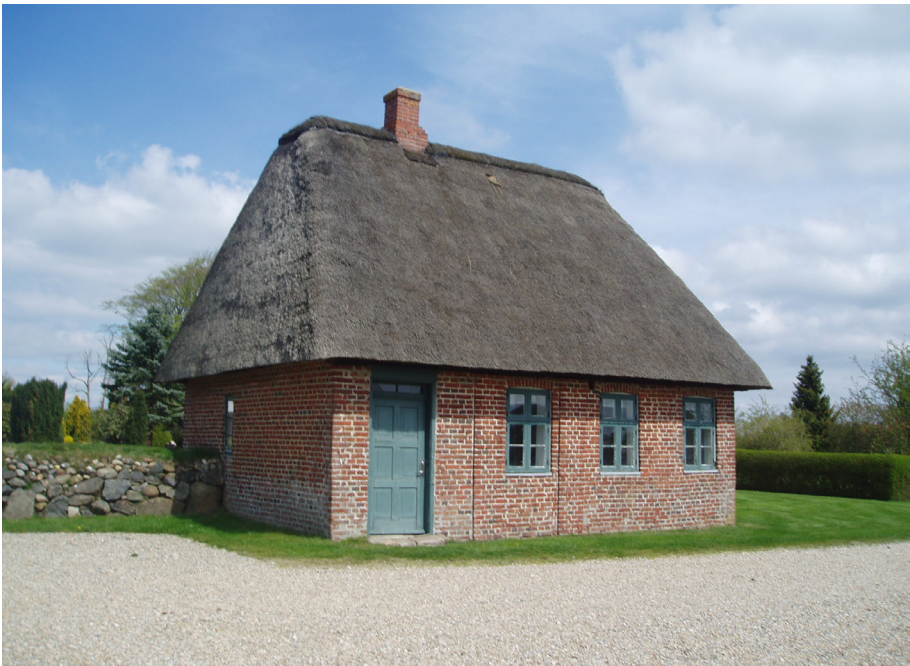
Figure 7. In the years following 1814, many schools were built throughout the Danish realms. Most of them were bricks buildings with thatch like the 1831 school in Hodde in the western part of Jutland. Having gone to the thatched school was a term that lasted until the mid-twentieth century.

Another main task for the school boards was providing the parish or market town with one or more schoolhouses. Even in the difficult economic times following state bankruptcy in 1813, the government prioritised permanent schoolhouses, and in the following decades the vast majority of schools were established in their own buildings. The government issued guidelines on how to construct a good school building and as a result, schoolhouses all over the country began to resemble each other. However, there were still a variety of local variations; school buildings were not only a question of economy but also dependent on local building traditions, the lord of the local estate and the number of pupils. The negotiations over the layout of a school building, exterior as well as interior, is central to the understanding of how the phenomenon of schools was understood by the main players, both centrally and in the local communities.