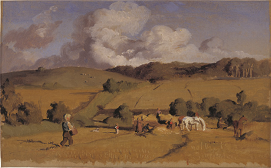
Figure 4. School absences were a nationwide problem in the nineteenth century as work played a major role for most children. In the picture, a boy is on his way across the field with a basket, presumably filled with food to the harvest workers. Source: Statens Museum for Kunst, Lorenz Frølich, "Landskab fra Holmstrup" (1845), Copenhagen.

out the nineteenth century. If children missed school without a legitimate reason, the school board had to impose a fine ( mulkt ) on the parents or masters. However, within the boards, where parents and employers were represented, there was no clear support to enforce the school Acts' requirement of regular schooling. Several boards did not impose fines or adhered to the lowest fine tariffs, or they ignored children not going regularly to school. As Denmark was struck by an agricultural crisis, the number of fines increased considerably, as the parents needed the children's labour. When the crisis slowly ebbed and there was more wealth, the picture scarcely changed and there were very few fines imposed, compared to the extent of missed school days. 44