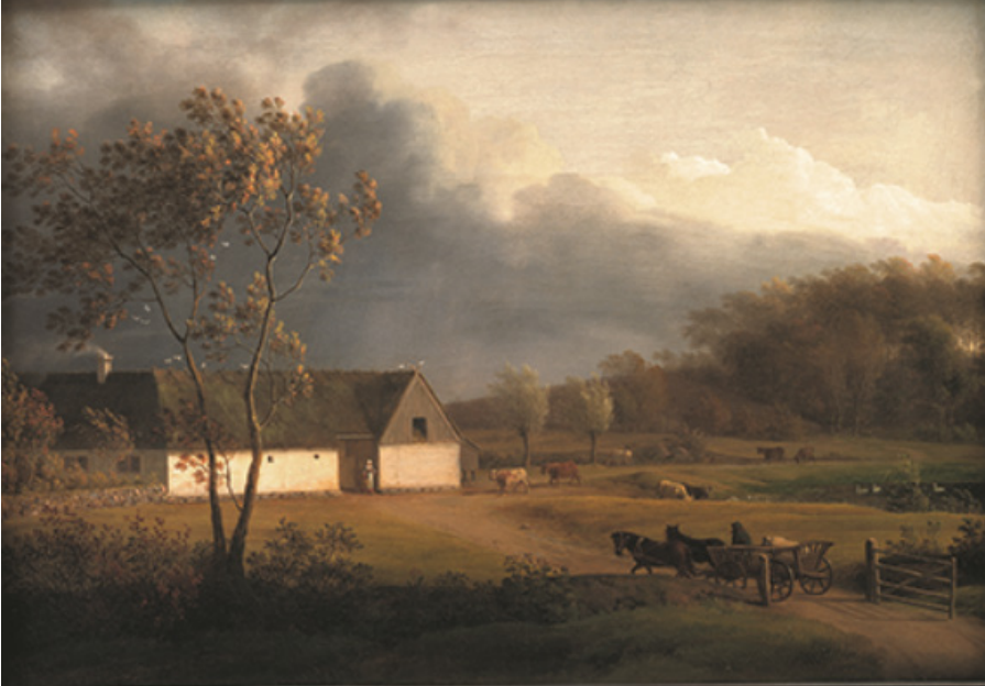
Figure 2. One of the most significant changes related to the agrarian reforms was the dissolution of the old village community and the relocation of the farms into the fields. It also meant longer school journeys for the children. Source: Statens Museum for Kunst, Jens Juel, "En sjællandsk bondegård under et optrækkende uvejr. Eigaard ved Ordrup" (ca. 1793), Copenhagen.

men and women. 13 There were, however, major shifts in the social structures, which influenced the development of Danish schools. Some of the most significant changes were related to the agrarian reforms ( landbrugsreformerne ), which introduced new crops, cultivation methods and farmers' responsibility for their own plots. 14 This meant the emergence of a stronger and more independent farmer class, with new needs and expectations of schooling for their children. Agricultural reforms also led to significant productivity gains and thus, better nutritional status and further population growth.