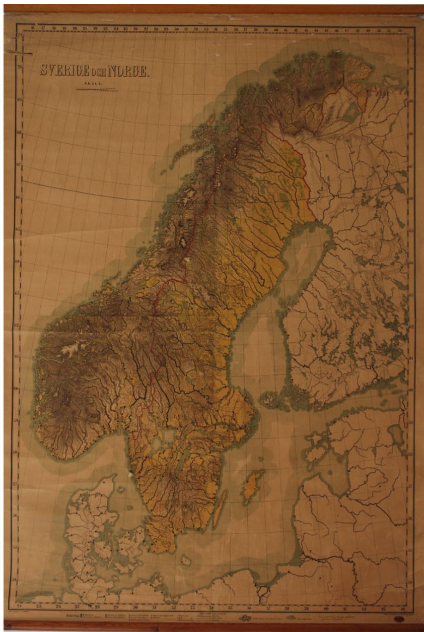
Figure 2. "Wall map of Sweden and Norway" from 1870

The pedagogical use of wall charts in lessons emerged only gradually in Sweden and the other Nordic countries. In Denmark, for example, wall charts were available in many schools by the 1870s, but only in the following decade were they used as proper teaching aids. Their function was not merely to demonstrate facts, but also to instill