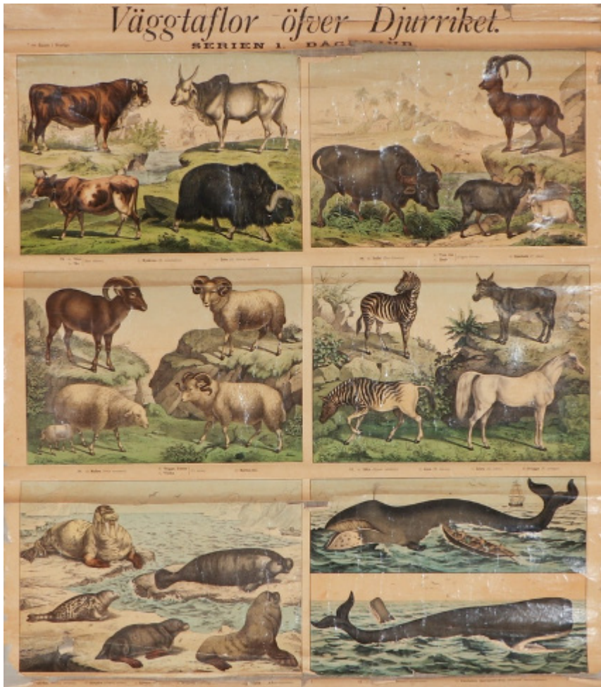
Figure 3. “Wall chart of the Animal Kingdom” from the 1880s.

In another district, the inspector considered that wall maps were used appropriately by most schools to teach geography. This was also the case for natural sciences, with teaching now mainly relying on wall charts of the human body and the animal kingdom (see Figure 3 above). Inspector Ekman claimed that the need for such materials grew constantly, but that schools had not yet realised their importance 105 or were unwilling to pay for them 106 as the state’s 1881 list of materials shows that wall charts were more expensive than other teaching materials. Wall charts of the animal kingdom came in a set of 10 images for 25 kronor, which was very expensive compared with a set of 20 biblical wall charts costing only 5 kronor. 107 Other