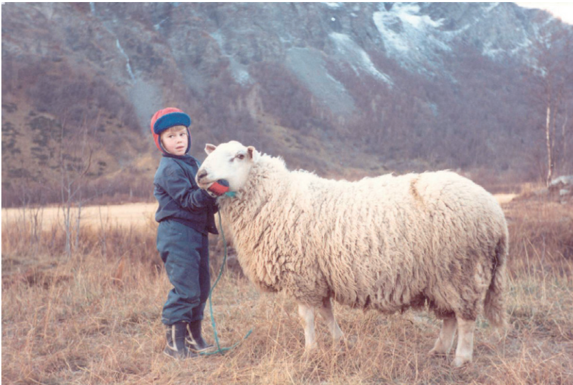
Fig. 2. Childhood on a sheep farm in the 1980s. A little girl—posing with a premium ram born of her own sheep—at work with dad.

Thus far, I have referred to working communities as equivalent to communities of practice. Wenger (2004: 89–104) postulates three elements in a community of practice: the ability to establish relationships, mutually dependent relations in work-related activities, and shared repertoires of engagement. When combined, these factors can create positive social energy and meaningfulness, but also inherent failures (inbreeding) and oppression. When these elements interact, the development and spread of knowledge can be optimized in communities of practice. The local cooperative environment that I have studied comprises small and larger communities of workers that have been spontaneously and partially informally organized according to their needs. These groups constitute the basis of the local, formally organized sheep farming. From Wenger's definitions, small groups of workers can be understood as constituting a complex community of practice, one that can also function as "a management tool" for governance by higher organizational levels within the industry. Through the community of practice, different activities are given meaning, individuals develop their identity and knowledge, and the decentralized form of learning also involves collective learning processes.