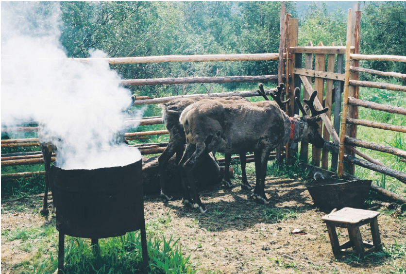
Fig. 5. Milking Corral, Nechera River, Irkutsk Oblast'.

Within archaeology, one of the classic structures is the milking corral—a