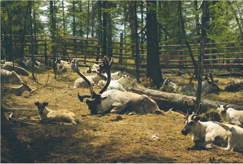
Fig. 6. Marshalling corral, Amudisy, Zabaikalskii Krai.