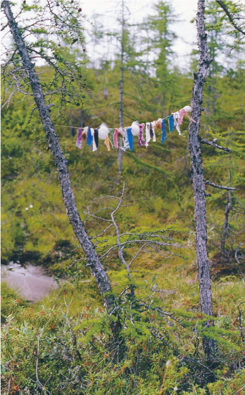
Fig. 3. A threaded set of fabrics gifted to the tundra, Khantaiskoe Ozero, Taimyr.