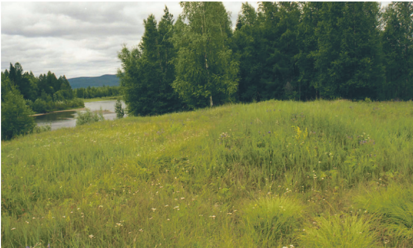
Fig. 7. A reindeer meadow at Lake Tolondo, Irkutsk Oblast'.

The example of architectures of domestication makes it easier to speak of relations between trust and domination, and indeed to leave behind these two stark opposites. Enclosures, or windblown ice-patches, both attract and confine, protect and release. They provide potentials or certain affordances which allow relationships to be built. They of course also have their own intrinsic qualities. Some places can be “good” (Johnson 2000) while others