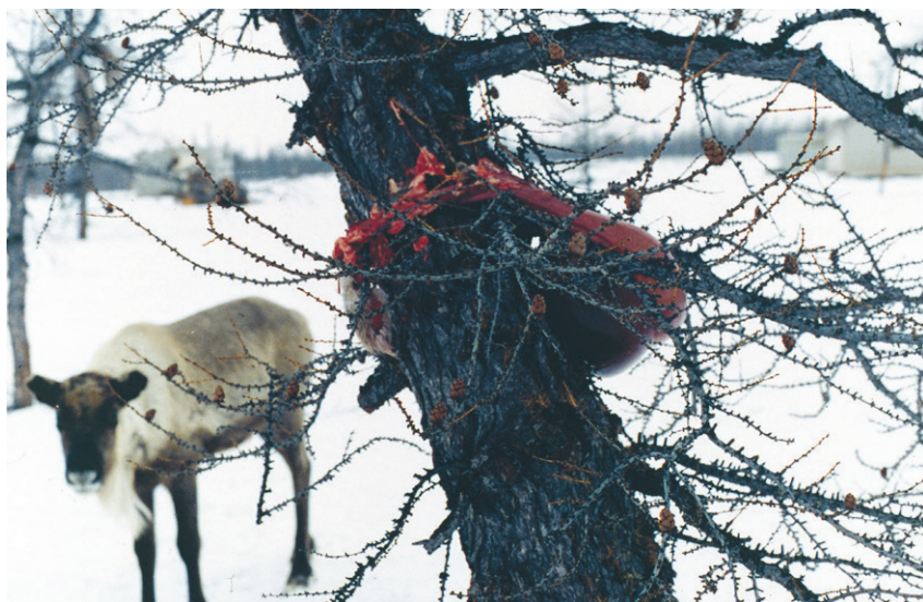
Fig. 2. The gift of a reindeer foetus to the tundra, Khantaiskoe Ozero, Taimyr.

clothing) to visible or non-visible entities on the land. Some of the traditional Siberian rituals are the most colourful where, for example, a foetus from a pregnant reindeer perhaps accidentally slaughtered will be hung in a tree as a “gift to the taiga” (Fig. 2). Similarly upon travelling into a new watershed a thread with coloured fabric will be hung on a tree as a token of respect to the spirit-masters which control relationships in the new region (Fig. 3). A common circumpolar ritual is the gifting of food or alcohol to the fire “feeding the fire.” These small acts of respect may seem far removed from sober collection of statistical data in the debate on climate change, but in their own highly personalized way they point to a culture of attention to the opportunities that the land has to offer. Common to many Northern