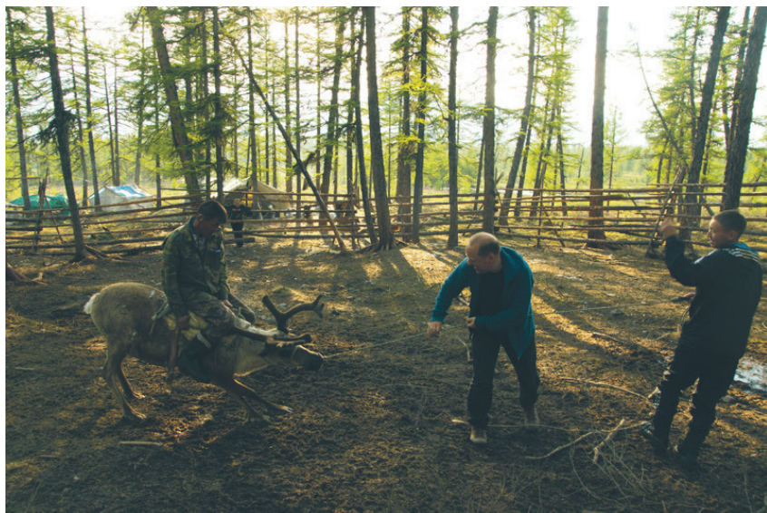
Fig. 4. Training a reindeer for saddle, Amudisy, Zabaikalskii Krai.