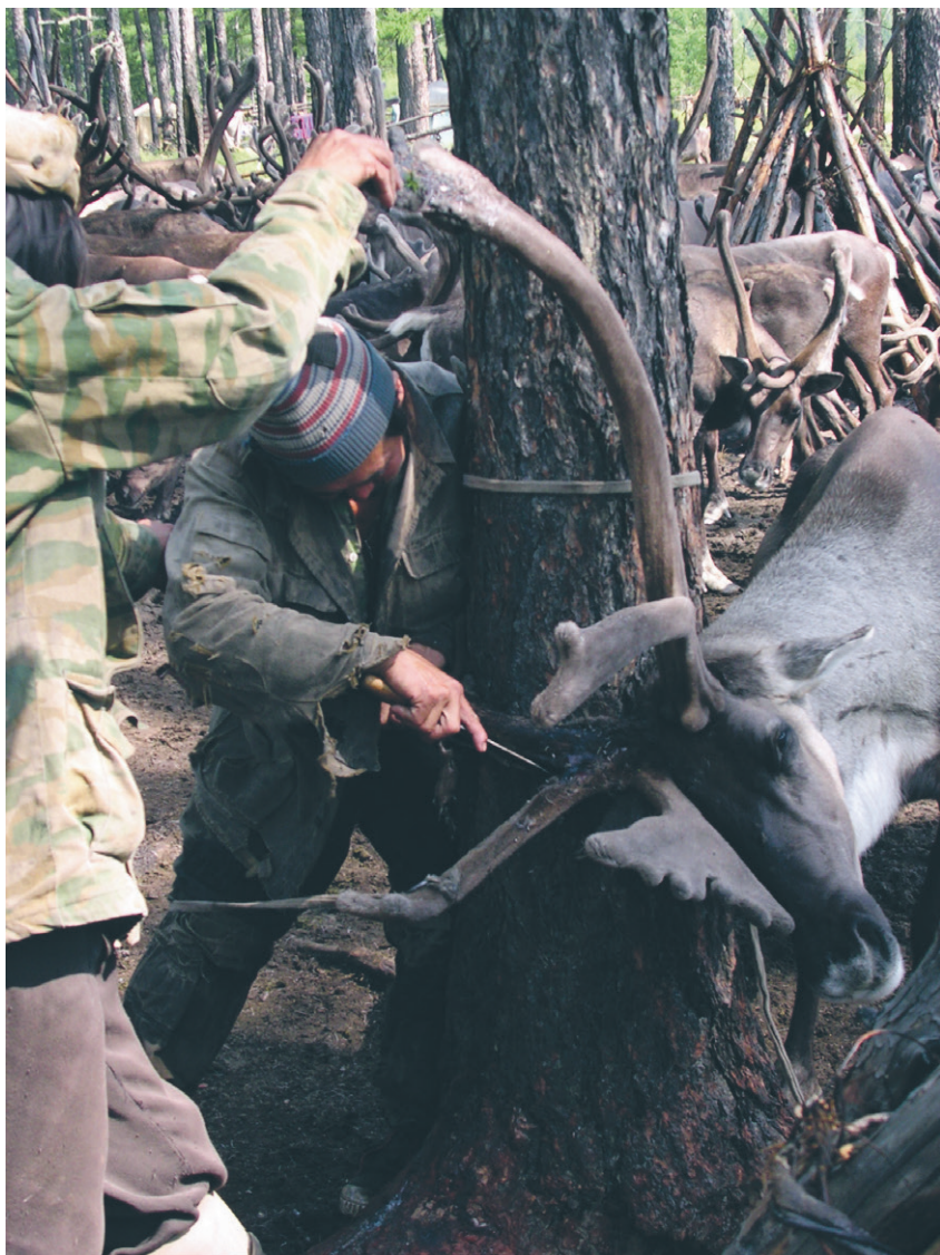
Fig. 1. Early summer antler trimming, Bazarnaia River, Zabaikalskii Krai.

as the first appearance of harnesses and hobbles. It also distracted attention from the more subtle ways that herd animals and people work together or show concern for each other.